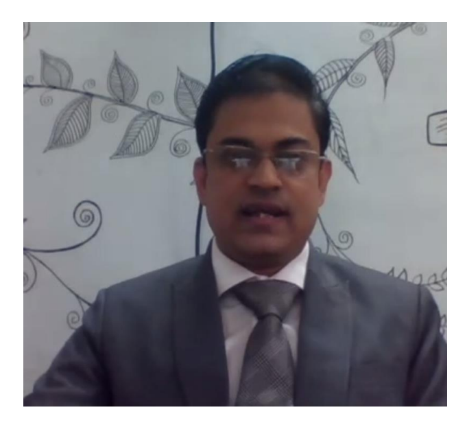
"Endeavours must be taken to uplift and promote the best interest of the child."

He also spoke on how children can be given up or adopted through procedures which have been simplified through the "CARINGS" initiative of Central Adoption Regulation Agency (CARA). He reminded us that the primary responsibility of all stakeholders must be in the best interest of the child.