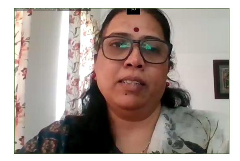
"All the government bodies need to come together and put a united front against the virus and against the perpetrators of crimes."

prioritise and take special care of their children and themselves during these challenging times.