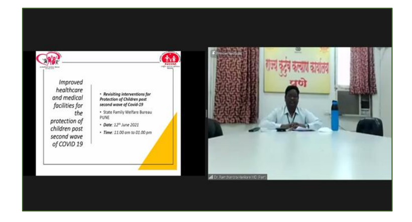
"Paediatric care givers must be prepared with resources, knowledge and management skills to be able to give effective care to children in need of care and protection."

prepare a comprehensive list of such services which and distribute the same to parents, guardians, institutions, and other places where children are housed. He also underlined the importance of the Sanjivani app which provides free medical aid to all and can be used to consult doctors for treatment of children, especially those in need of care and protection. Lastly, he reminded us that irrespective of a pandemic, all children must be protected, educated, and their growth and progress should be our utmost priority.