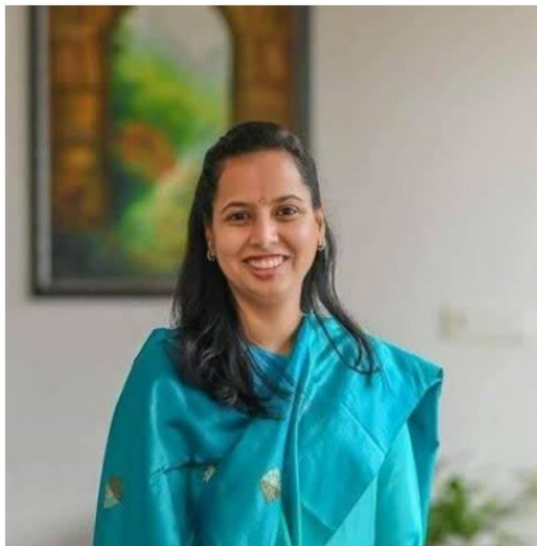
HONOURABLE KUMARI ADITI SUNIL TATKARE (FROM DATE 14TH JULY 2023 TILL DATE)