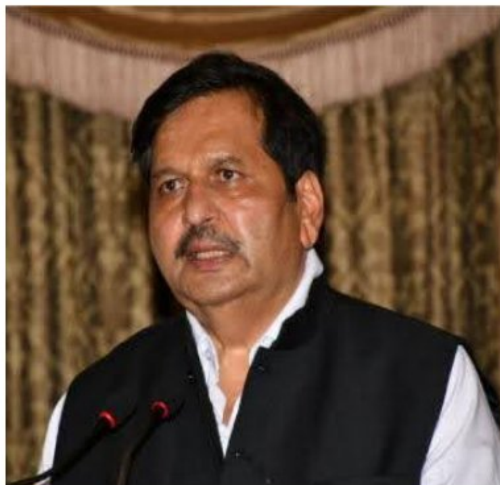
HONOURABLE SHRI MANGAL PRABHAT LODHA (FROM DATE 14TH AUGUST 2022 TILL 14TH JULY 2023)